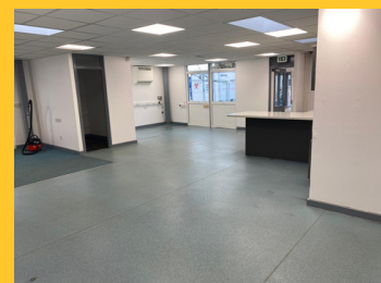
Staff Room After