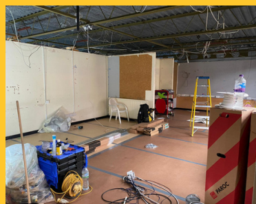
Start of Year 1

The building works at Cherry Tree are well under way. Phase 1 (the staffroom) is complete and we are now embarking on phase 2 and 3 (This will include Year 1 and 2 classrooms). This part of the school will have a substantial refurbishment with an added corridor and outdoor access which will significantly improve the classroom experience for the children. We will keep you updated on the progress of the works.