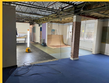
Start of Year 1