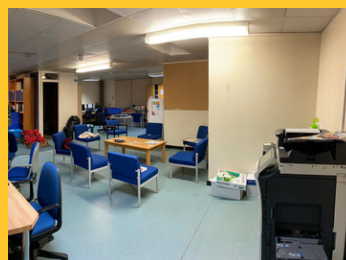
Staff Room Before

The building works at Cherry Tree are well under way. Phase 1 (the staffroom) is complete and we are now embarking on phase 2 and 3 (This will include Year 1 and 2 classrooms). This part of the school will have a substantial refurbishment with an added corridor and outdoor access which will significantly improve the classroom experience for the children. We will keep you updated on the progress of the works.