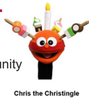
Chris the Christingle

This half term we have really enjoyed welcoming visitors from our local community to support our RE curriculum.