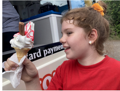
Year 6 enjoying a well deserved ice cream treat at the end of SATS

We have always known our Year 6s are incredible young people but this last week they went above and beyond! The perseverance and resilience they displayed in their approach to their SATS, the care and consideration of each other, their willingness to help make sure the week ran smoothly - they were fantastic. Year 6 we are so proud of the individuals you are becoming. You are a credit to our school.