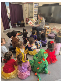
Celebrating World Book Day across the trust

For those interested in exploring this research, you can access the full toolkit at: https://www.research.herts.ac.uk/ws/portalfiles/portal/70448150/Let_s_go_outside_Forest_School_for_pupils_with_SEND_and_Children_with_Autism.pdf